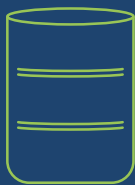
5 Gallon Pail Metal or Poly