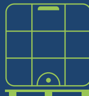
270 Gallon Tote Poly or Steel