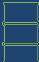
55 Gallon Drum Metal or Poly