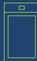
1250 Liter Stainless Steel Returnable Container

Container availability may vary based on location.