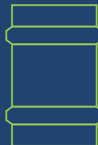
200 Liter Stainless Steel Returnable Container