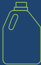
1 Gallon Poly